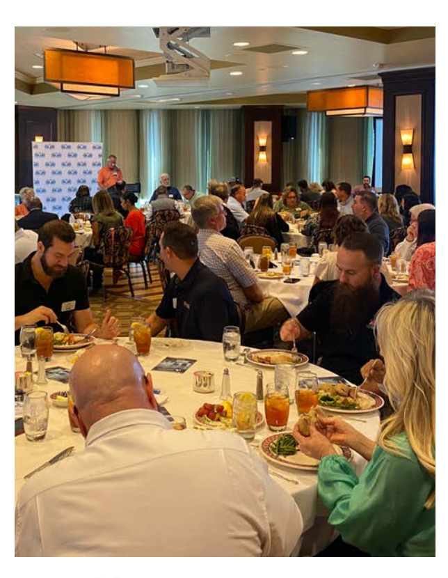
Monthly Meetings 2024